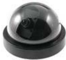
12VDC Dome Camera